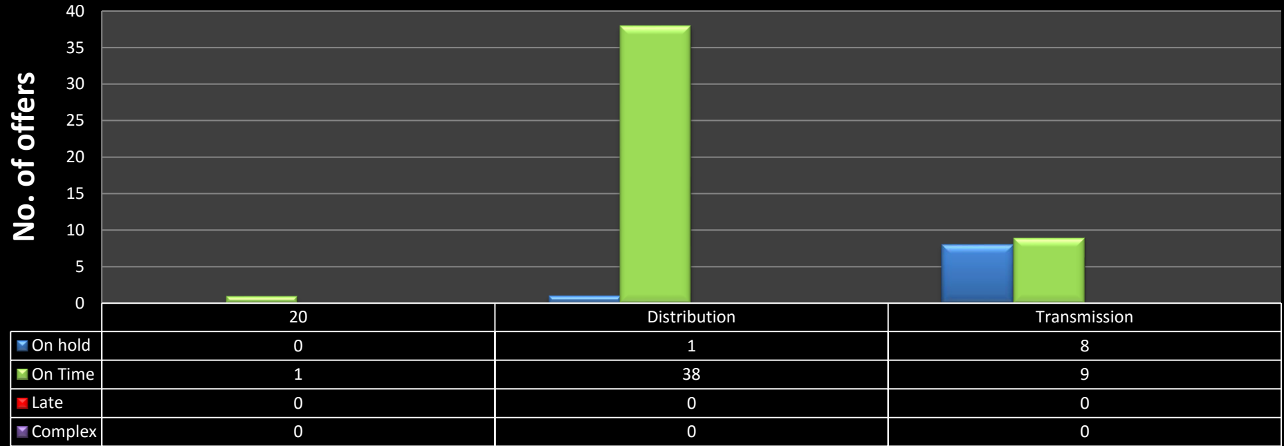
No. of Offers Being Processed by TSO as at 06/12/2016