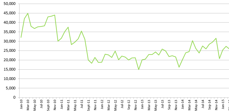
Figure 1a Electricity Total Monthly Switches Jan 2010-Mar 2015