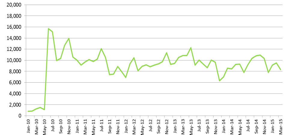
Figure 2a Gas Total Monthly Switches Jan 2010- Mar 2015